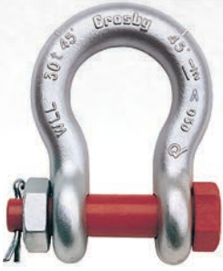
G-2140 / S-2140

G-2140 meets the performance requirements of Federal Specification RR-C-271F, Type IVA, Grade B, Class 3, except for those provisions required of the contractor. For additional information, see page 452.