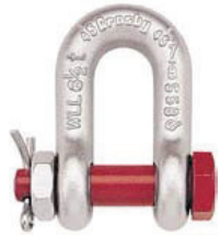
G-2150 / S-2150

G-2150 Bolt Type Chain shackle: Thin hex head bolt - nut with cotter pin. Meets the performance requirements of Federal Specification RR-C-271F Type IVB, Grade A, Class 3, except for those provisions required of the contractor. For additional information, see page 450.