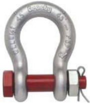
G-2130 / S-2130

G-2130 Bolt Type Anchor shackles with thin head bolt - nut with cotter pin. Meets the performance requirements of Federal Specification RR-C-271F Type IVA, Grade A, Class 3, except for those provisions required of the contractor. For additional information, see page 450.