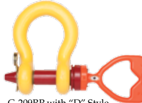
G-209RP with "D" Style Handle Shown