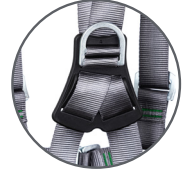
Rear attachment point