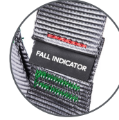
Rip stitch indicators