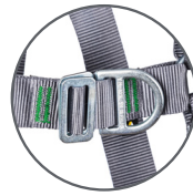
Front attachment point