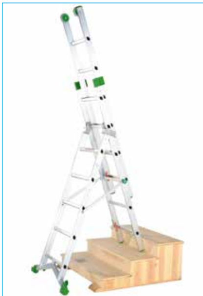
Extended stairwell ladder