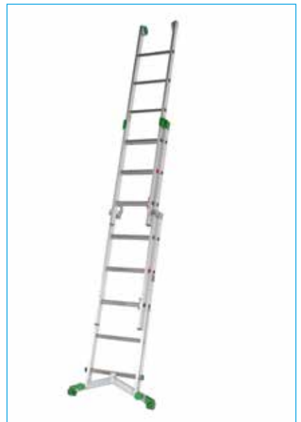
3-Section extension ladder