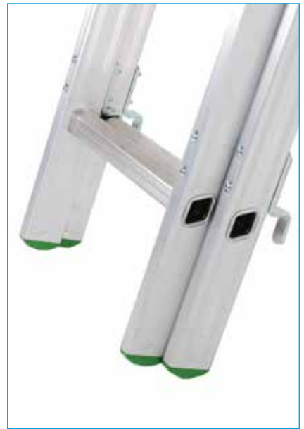
Large box section stiles with twist-proof rung connections