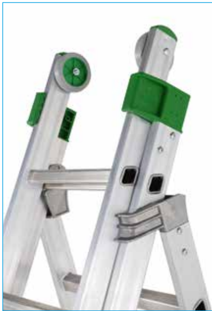
Integrated wall wheels to assist in placement