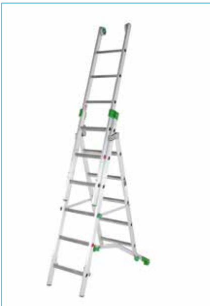
Extended A-frame step ladder