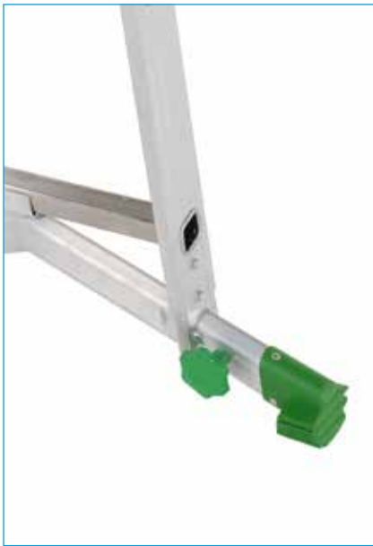
Telescopic stabiliser for use on uneven ground