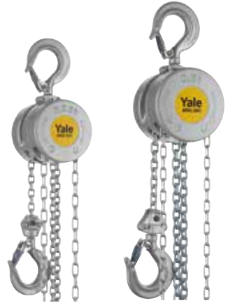
Capacity 250 kg