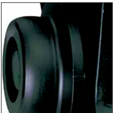
Wheel with cambered profile